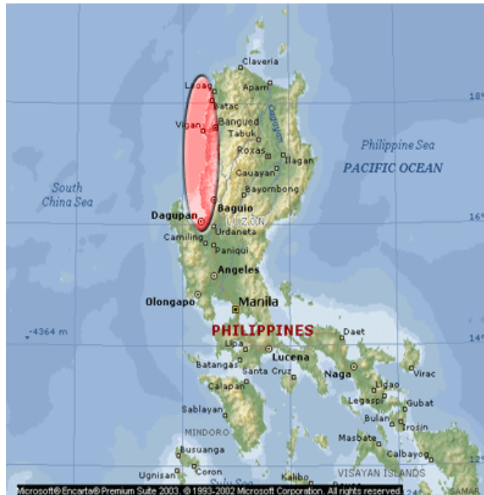
Highlighted region where the program will be implemented

Child labourers between the ages of seven -17, whose work is related to the tobacco industry in 100 selected barangays (villages) in the region highlighted on the map. This, which includes the provinces of Ilocos Norte, Ilocos Sur, La Union and Pangasinan.