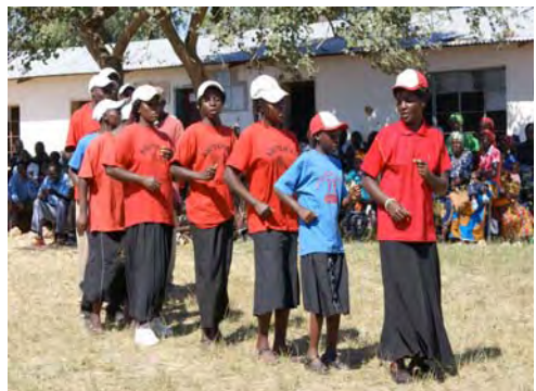
Zambia - awareness-raising activity