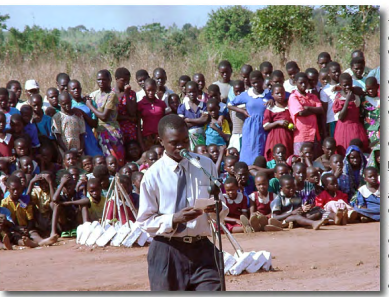
Malawi - Student making speech during World Day Against Child Labour

•Overcoming huge obstacles a clinic was built.