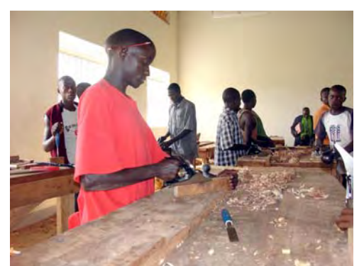
Uganda - vocational training students