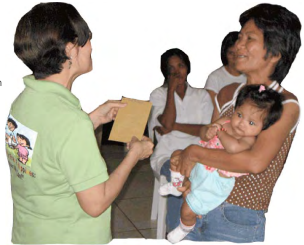
The Philippines - child beneficiary's mother receiving school grant

To improve selection processes and make the project more effective the ECLTI Steering Committee re-organised themselves. The changes included the establishment of technical working groups to focus and develop policies on issues like "Monitoring and Evaluation and Guidelines on Educational and Livelihood Assistance".