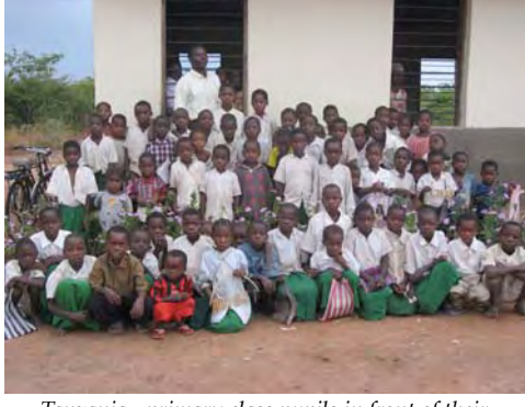
Tanzania - primary class pupils in front of their renovated school

In July 2006, the programme was expanded to cover a further 350 villages thus reaching an additional population of one hundred thousand. The programme builds on the previous work done during the pilot phase and continues to include awareness raising and