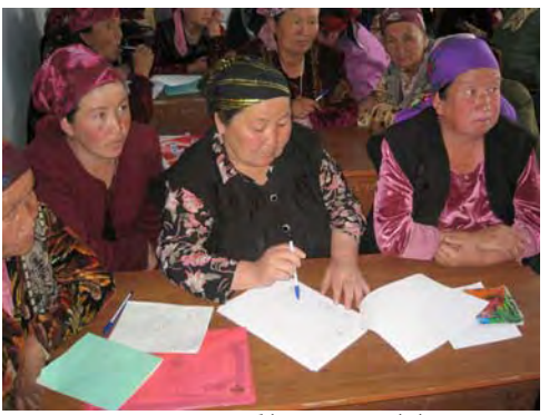
Kyrgyzstan - working group training