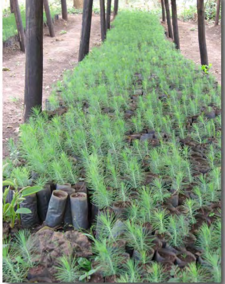
Uganda - tree seedling nursery