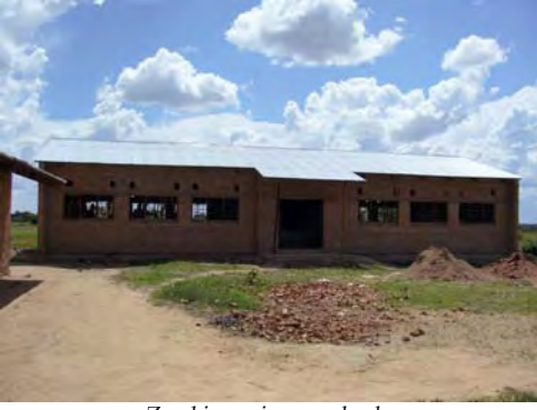
Zambia - primary school

including buildings, trained teachers, and materials, where there was none amongst a tobacco community of over 16,000. As HIV is a primary driver of child labour 10,000 people