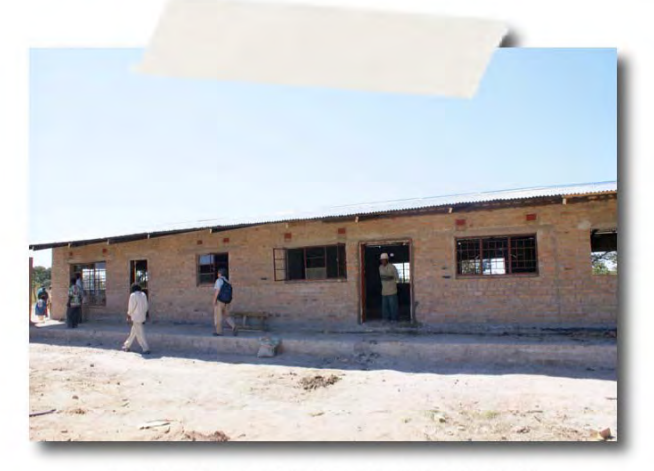
Zambia - Vocational training institute being built