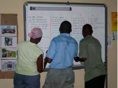
Tanzania - vocational training students