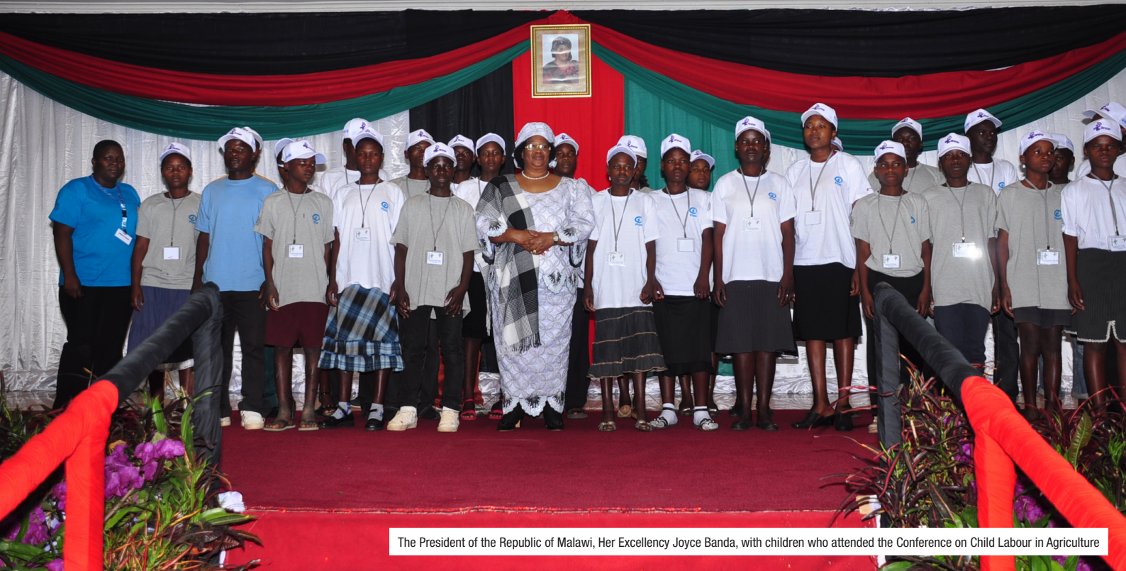
The President of the Republic of Malawi, Her Excellency Joyce Banda, with children who attended the Conference on Child Labour in Agriculture