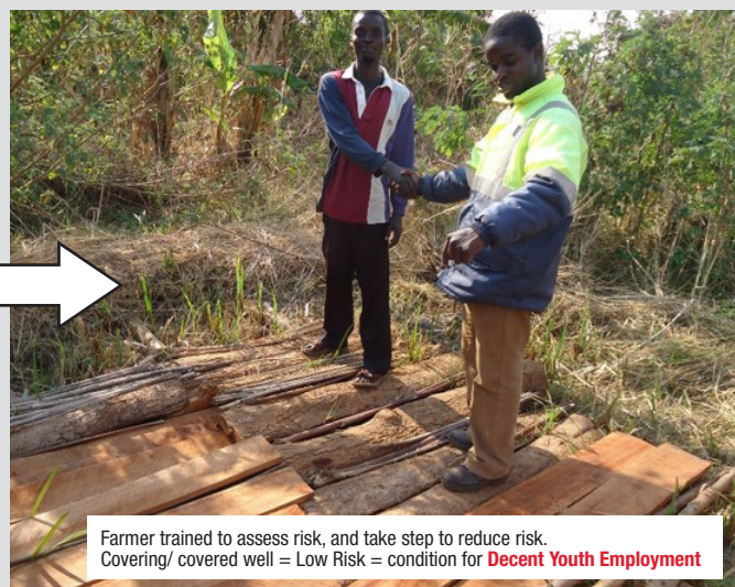
Farmer trained to assess risk, and take step to reduce risk. Covering/ covered well = Low Risk = condition for Decent Youth Employment