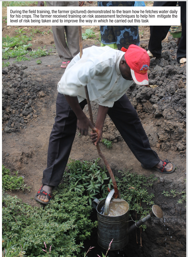
During the field training, the farmer (pictured) demonstrated to the team how he fetches water daily for his crops. The farmer received training on risk assessment techniques to help him mitigate the level of risk being taken and to improve the way in which he carried out this task