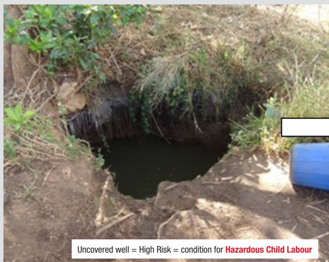
Uncovered well = High Risk = condition for Hazardous Child Labour