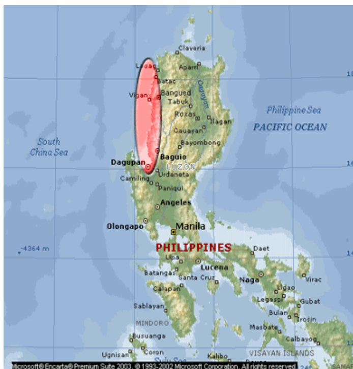
Highlighted region where the program will be implemented